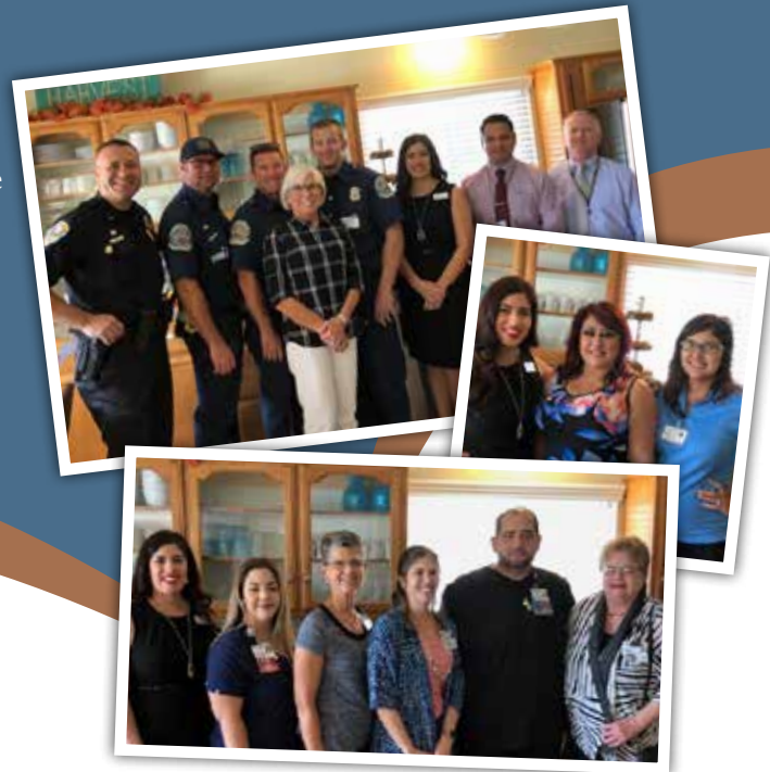
Service Partner Appreciation Fall Open House.