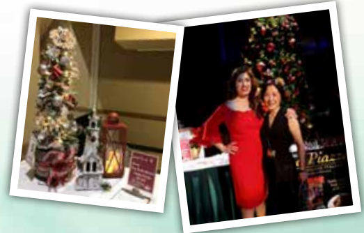
Visalia Chamber of Commerce Annual Christmas Tree Auction.